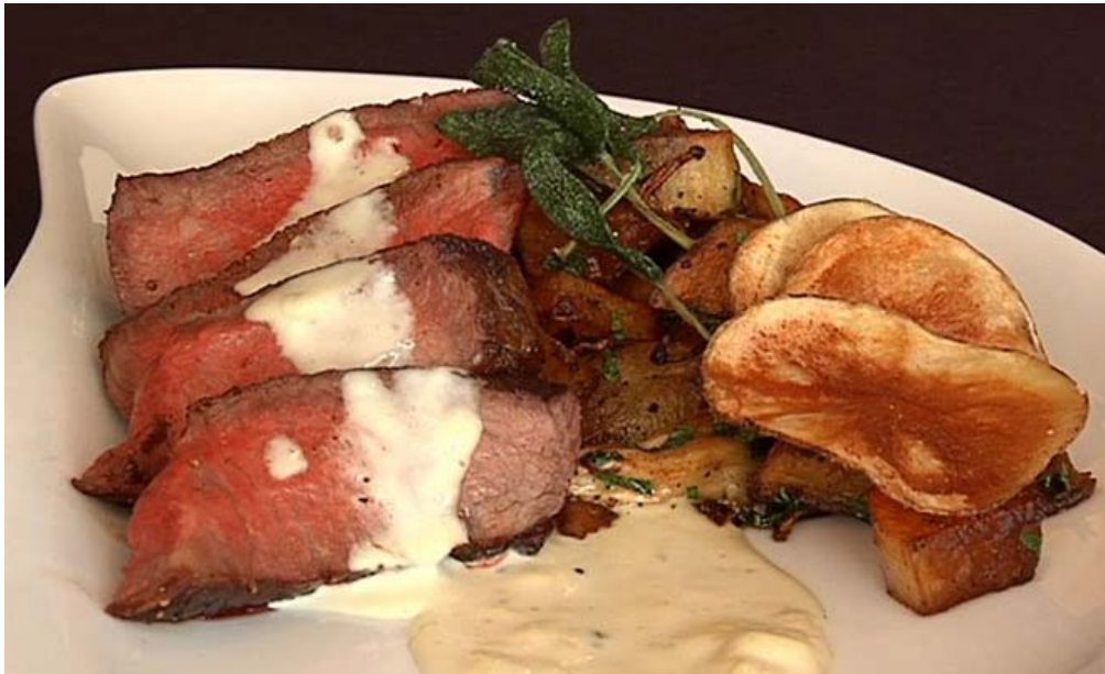
Cress Restaurant's Kobe Steak Sliders